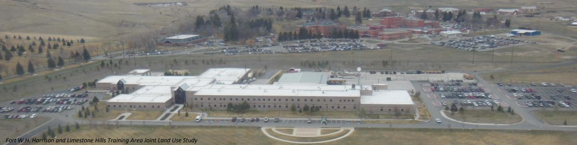
Fort W.H. Harrison and Limestone Hills Training Area Joint Land Use Study

For decades, Montana has been quietly supporting all branches of the military with unique training opportunities.